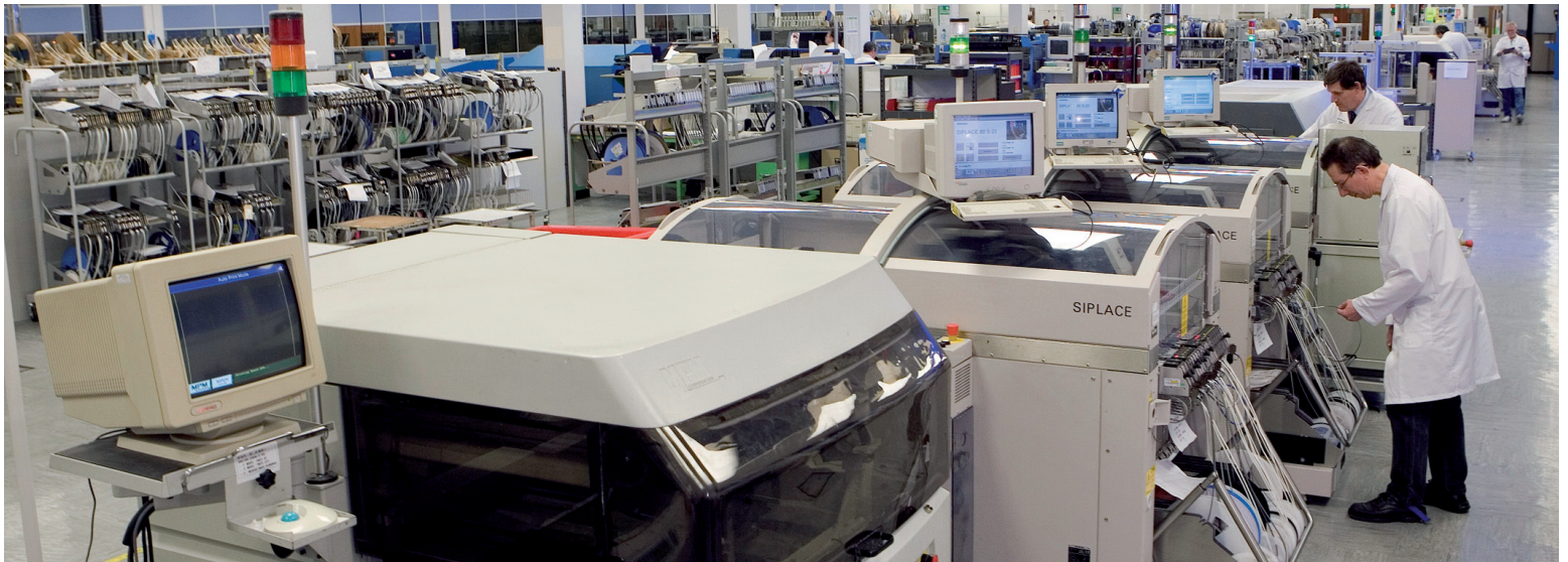
Production line at SMS Electronics.

As development engineers implement and use this infrastructure more extensively to test and debug prototypes, the tests created at the prototype stage can then be re-used directly within a high-speed production test strategy, using equipment comparable to the boundary scan tools used